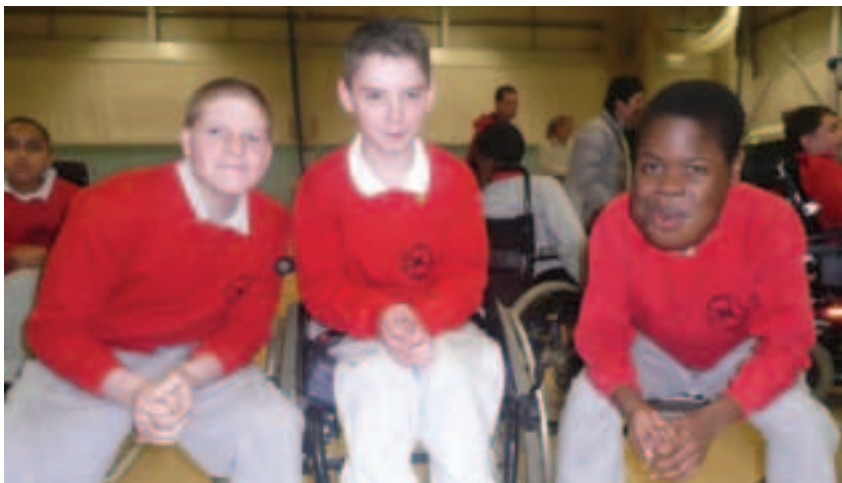
St Giles Senior Team Winners.