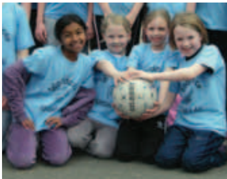
Netball 4 All

Schools received the mark if at least 90% of pupils were achieving at least two hours of high quality PE each week.