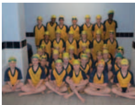
The winning team from Margaret Roper.

The Cross-country festival was held on a lovely sunny evening with excellent help from the Sports Leaders from Thomas More. Regina Coeli won the event and went on to become the Croydon champions.