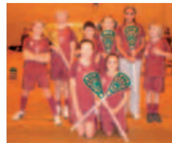
The Hayes Primary School, winners of their lacrosse festival

The winners of the Croydon tournament will go through to the London Tournament.