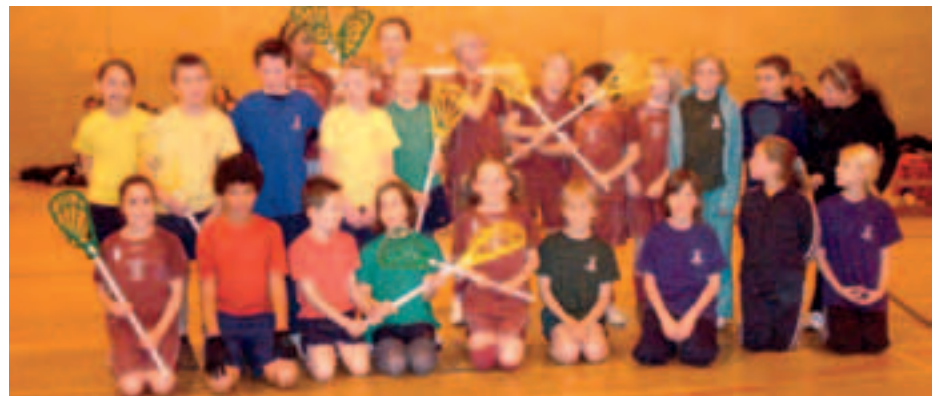
The Hayes, Chipstead Valley and Smitham Primary Schools