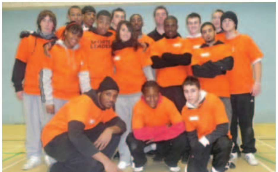
Young Sports Leaders from Coulsdon College