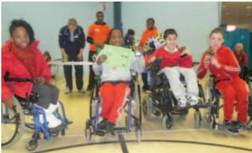
St Giles Junior Team Winners

Congratulations to all our competitors – we are all very proud of you.